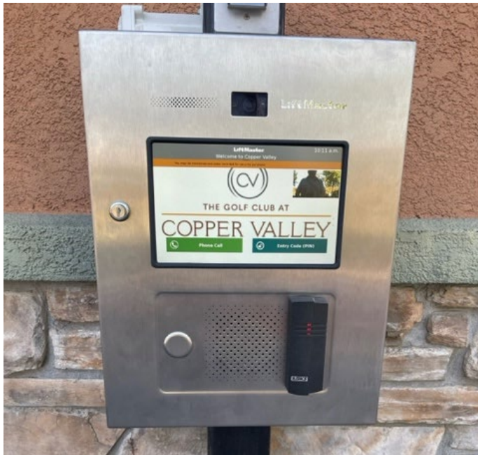
The Call Box is mounted on the wall of the Gate House And is accessible to drivers in left -side entry lane