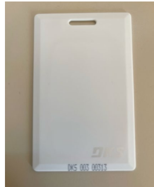
Swipe Cards will continue to open the left side gate for you