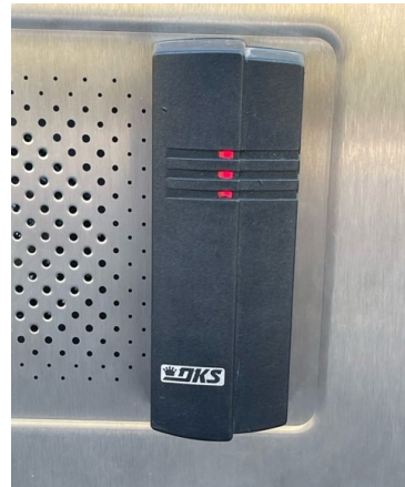
The Swipe Card Reader is located on the Call Box