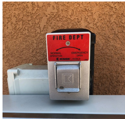
An Emergency Vehicle gate opener is located above the Call Box