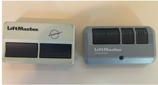
Remote Transmitter ("Clickers") will continue to open the right-side entry gate for you